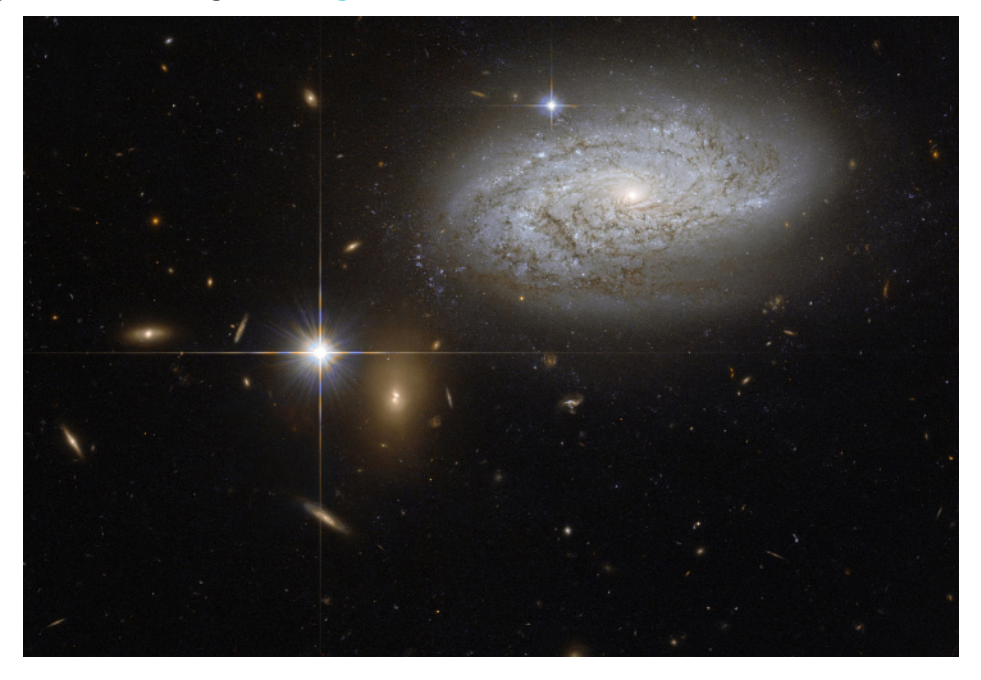
Figure 26.12 Type Ia Supernova. The bright object at the bottom left of center is a type Ia supernova near its peak intensity. The supernova easily outshines its host galaxy. This extreme increase and luminosity help astronomers use Ia supernova as standard bulbs.

Several other kinds of standard bulbs visible over great distances have also been suggested, including the overall brightness of, for example, giant ellipticals and the brightest member of a galaxy cluster. Type Ia supernovae, however, have proved to be the most accurate standard bulbs, and they can be seen in more distant galaxies than the other types of calibrators. As we will see in the chapter on The Big Bang , observations of this type of supernova have profoundly changed our understanding of the evolution of the universe.